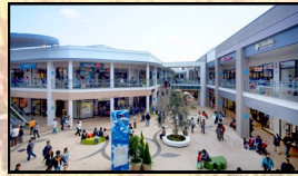
Mitsui Outlet Park