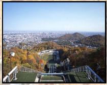
Okurayama Ski Jump